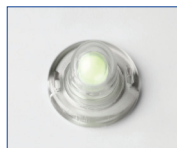
Flight Refueling Markers