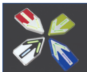
Landmine Route Markers